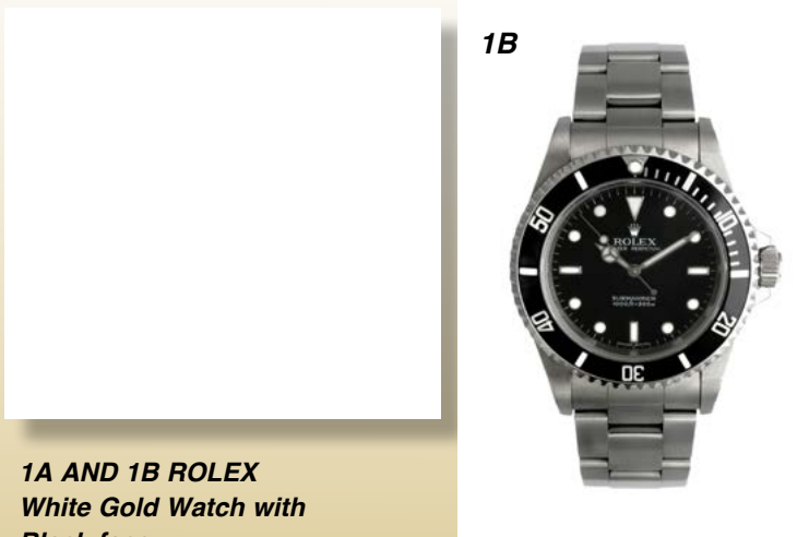
1A AND 1B ROLEX White Gold Watch with Black face