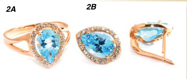
2A AND 2B Yellow Gold, Sapphire and Diamond Ring with Matching Pierced Earrings

Today, photographs have become an integral part of how society expresses itself. Through the arts, journalism, and even the legal profession, we use the photograph to tell a story. Memories are preserved and documented to